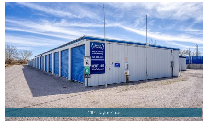
1105 Taylor Place