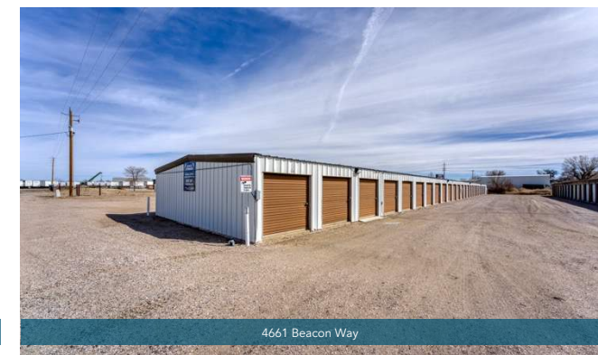
4661 Beacon Way