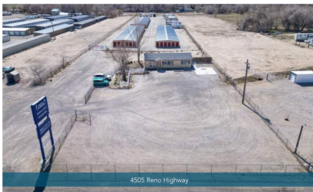
4505 Reno Highway