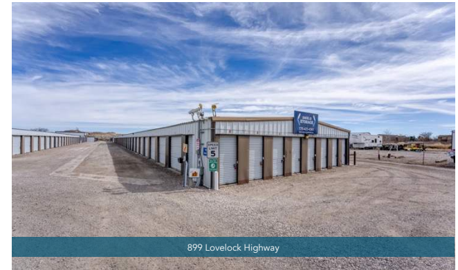
899 Lovelock Highway