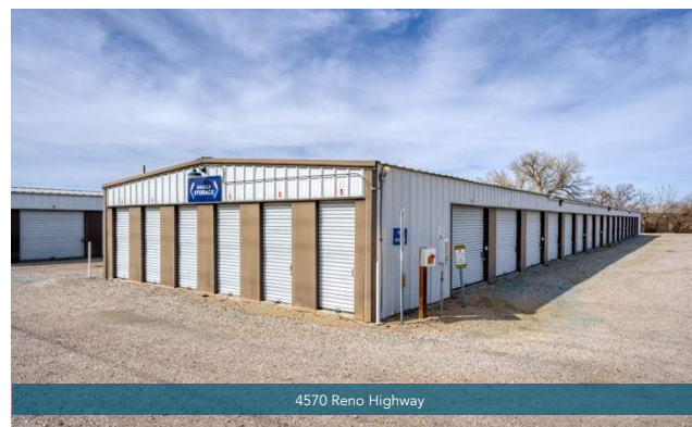
4570 Reno Highway