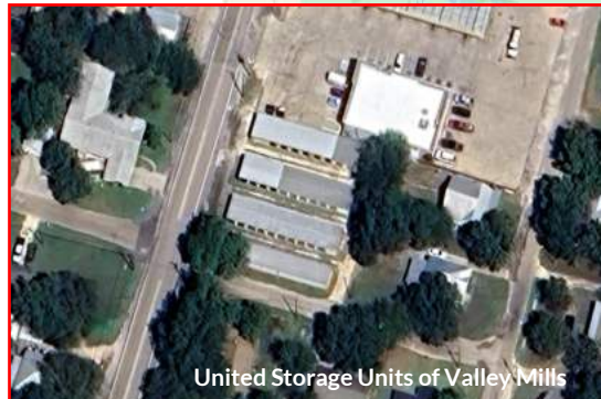
United Storage Units of Valley Mills