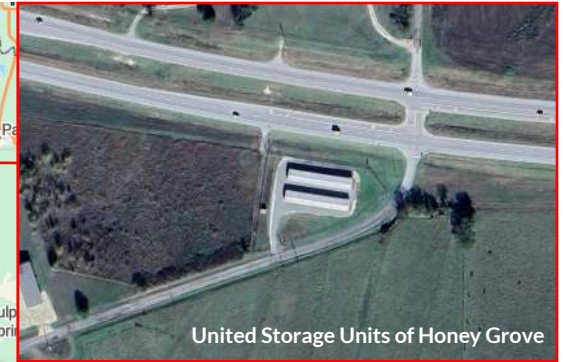
United Storage Units of Honey Grove