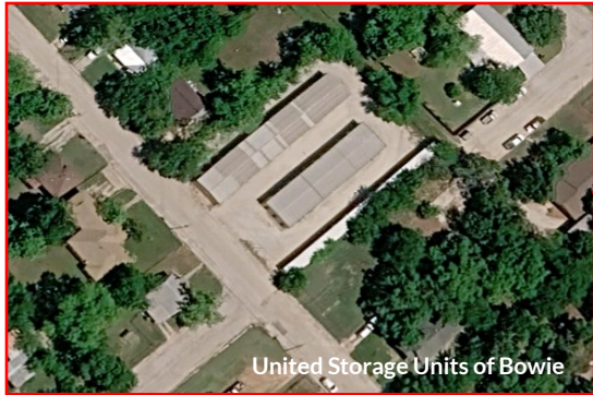
United Storage Units of Bowie