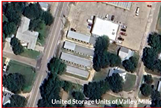
United Storage Units of Valley Mills