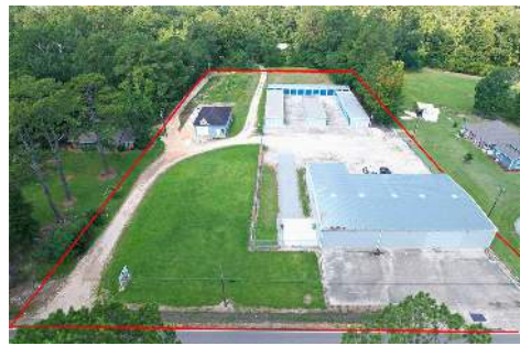
Value Storage Units of Hammond 2