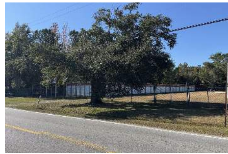
Value Storage Units of Pass Christian