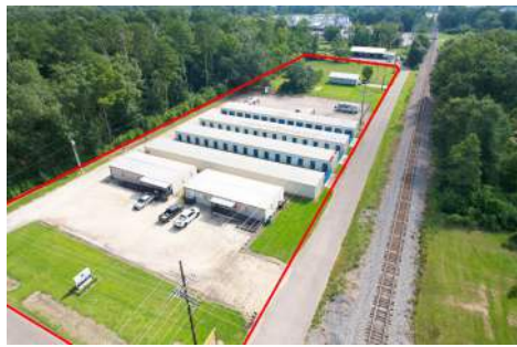
Value Storage Units of Hammond 1