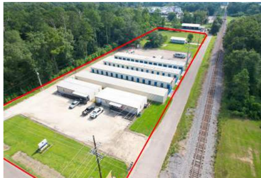
Value Storage Units of Hammond 1