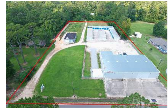
Value Storage Units of Hammond 2