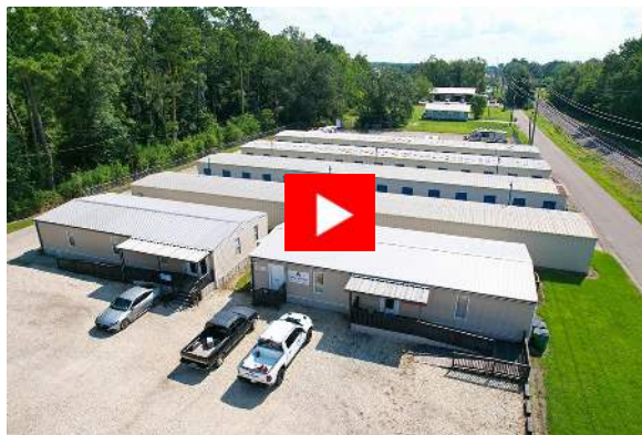
Drone Video: Value Storage Units of Hammond 1