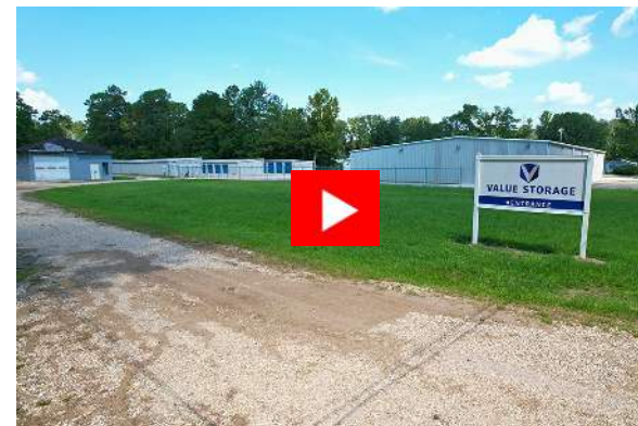
Drone Video: Value Storage Units of Hammond 2