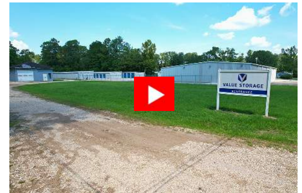
Drone Video: Value Storage Units of Hammond 2