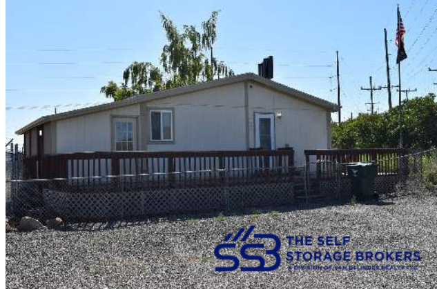
Argus Self Storage Advisors and Van Delinder Realty, LLC have compiled this information from sources believed to be reliable however can make no warranties, express or implied, to it's accuracy. Buyer to conduct their own due diligence.