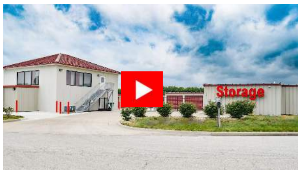
Attic Storage Peculiar

Goldman Investment Advisors 913-707-9030 / lgoldman@selfstorage.com 913-575-4790 / derek@selfstorage.com