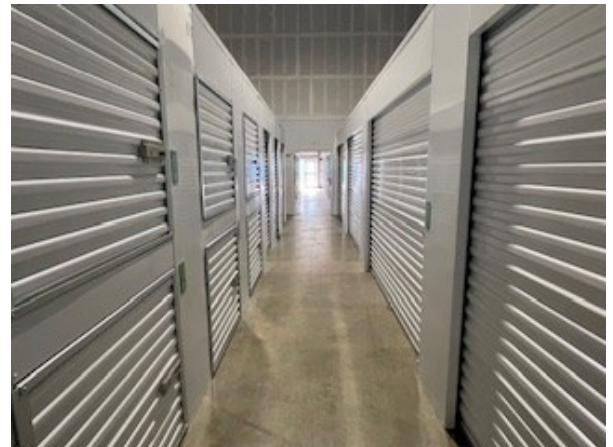
Argus Self Storage Advisors and Dominus Commercial have compiled this information from sources believed to be reliable however can make no warranties, express or implied, to its accuracy. Buyer to conduct their own due diligence.