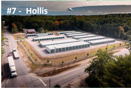
#7 - Hollis