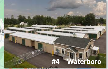
#4 - Waterboro