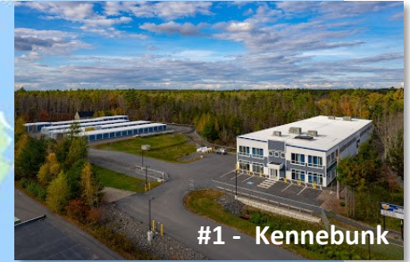
#1 - Kennebunk