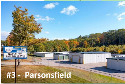
#3 - Parsonsfield