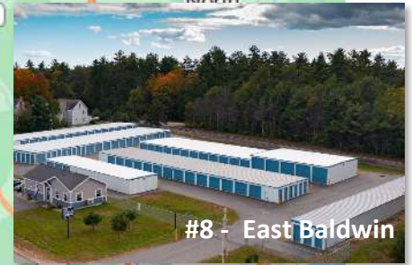
#8 - East Baldwin