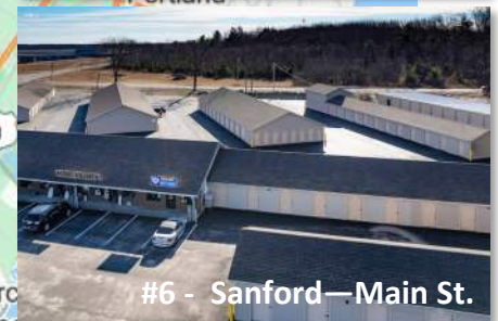
#6 - Sanford—Main St.