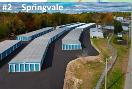
#2 - Springvale