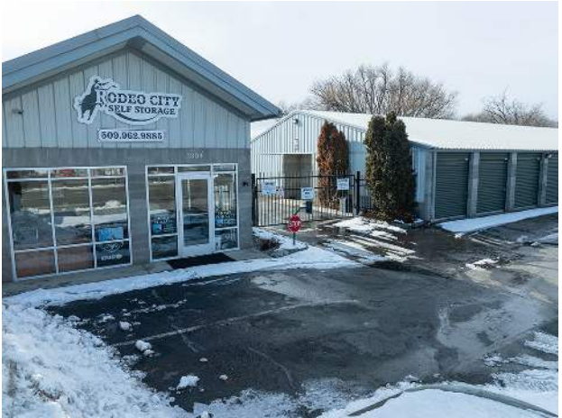
Argus Self Storage Advisors and American Real Estate Associates have compiled this information from sources believed to be reliable however can make no warranties, express or implied, to it's accuracy. Buyer to conduct their own due diligence.