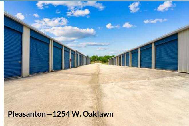
Pleasanton—1254 W. Oaklawn