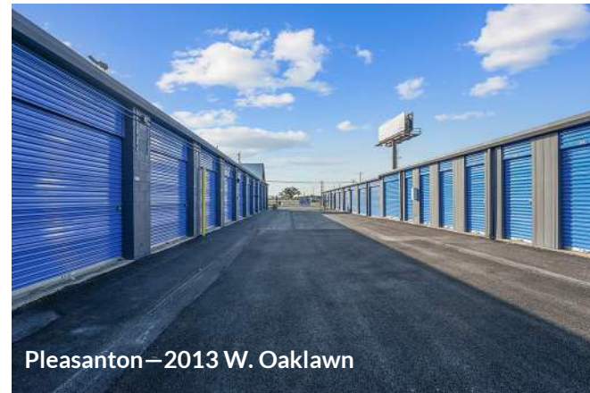
Pleasanton—2013 W. Oaklawn