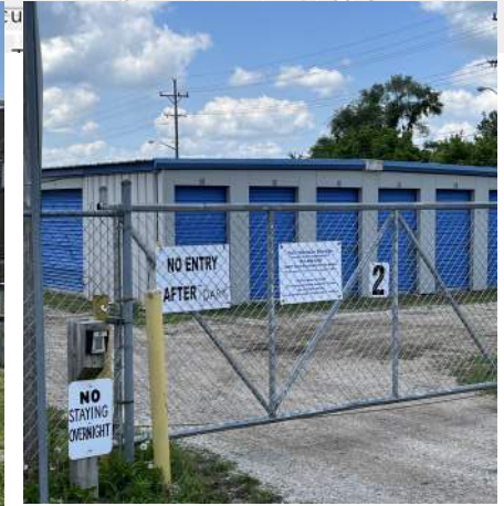
Argus Self Storage Advisors and Schick & Associates have compiled this information from sources believed to be reliable however can make no warranties, express or implied, to it's accuracy. Buyer to conduct their own due diligence.