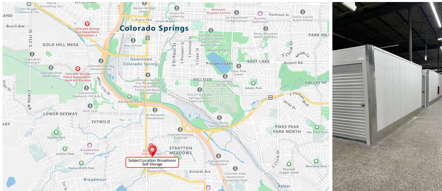
Argus Self Storage Advisors has compiled this information from sources believed to be reliable however can make no warranties, express or implied, to it's accuracy. Buyer to conduct their own due diligence.