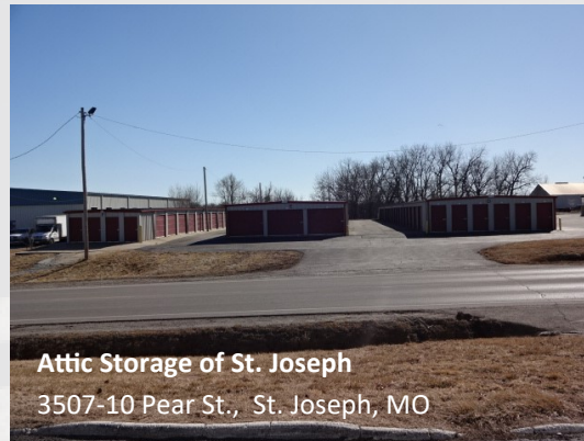
Attic Storage of St. Joseph 3507-10 Pear St., St. Joseph, MO