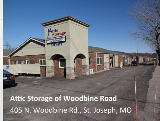
Attic Storage of Woodbine Road 405 N. Woodbine Rd., St. Joseph, MO