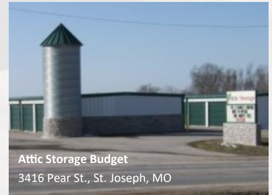
Attic Storage Budget 3416 Pear St., St. Joseph, MO