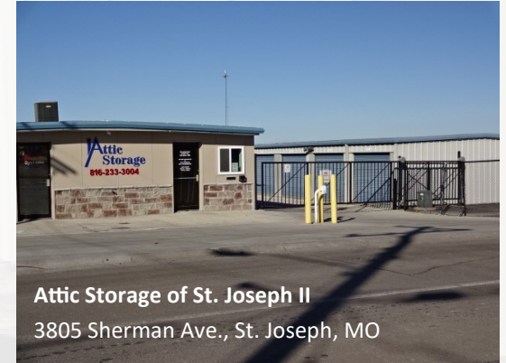
Attic Storage of St. Joseph II 3805 Sherman Ave., St. Joseph, MO