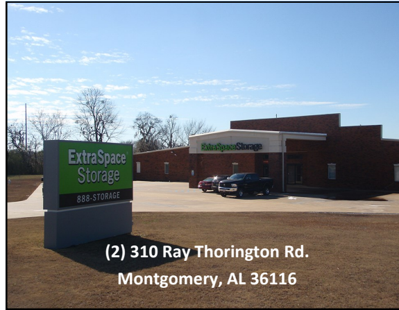
(2) 310 Ray Thorington Rd. Montgomery, AL 36116