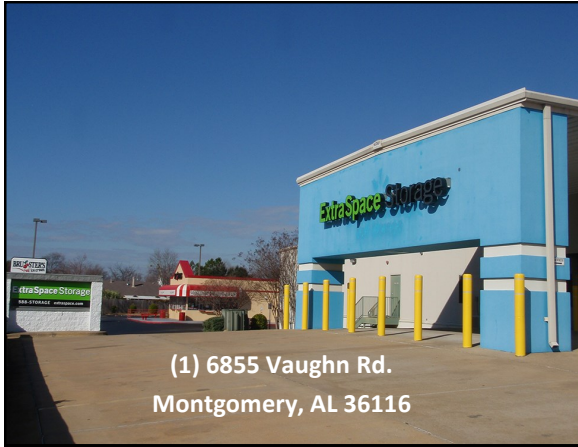
(1) 6855 Vaughn Rd. Montgomery, AL 36116